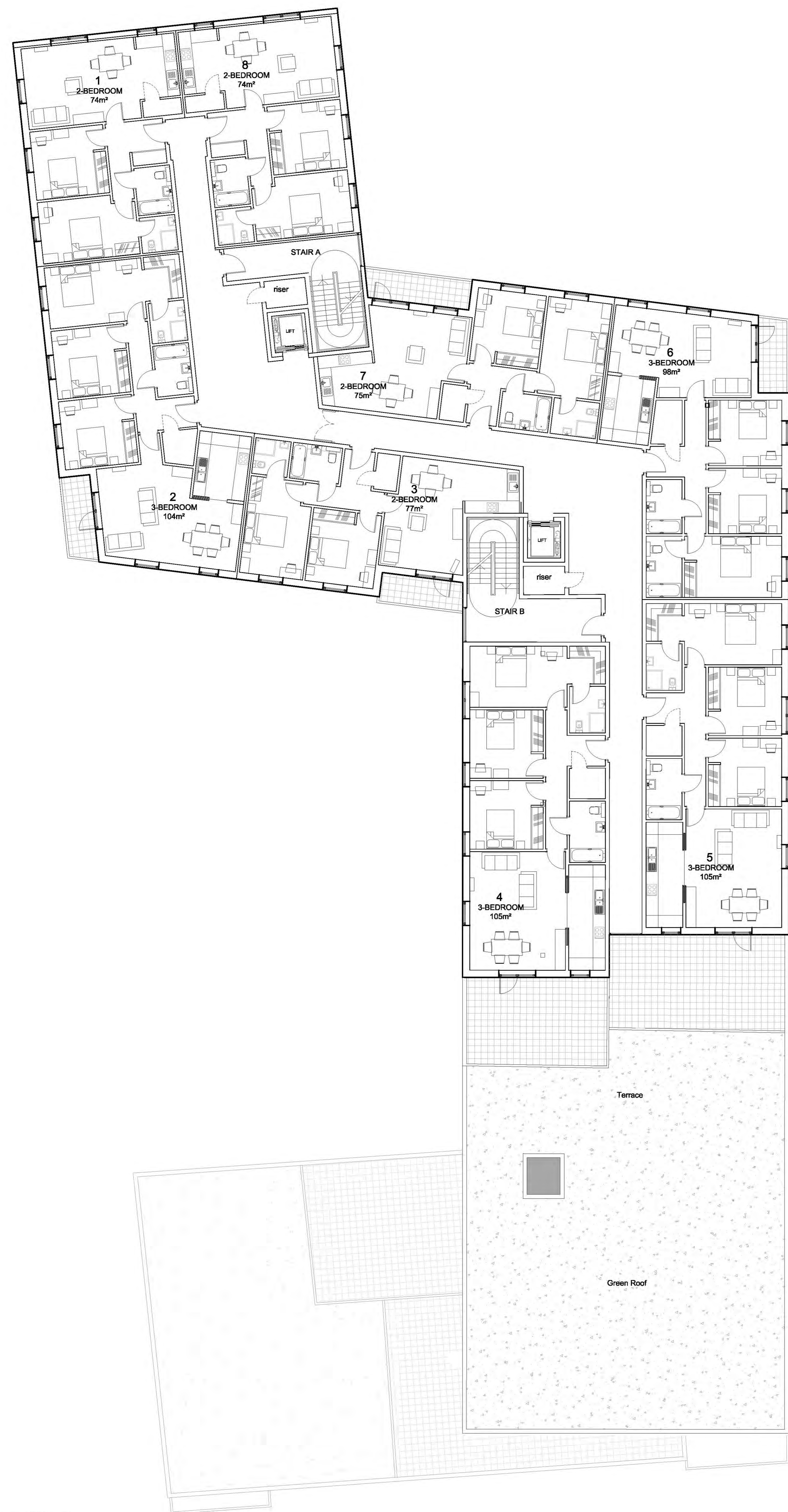
Fifth Floor Plan