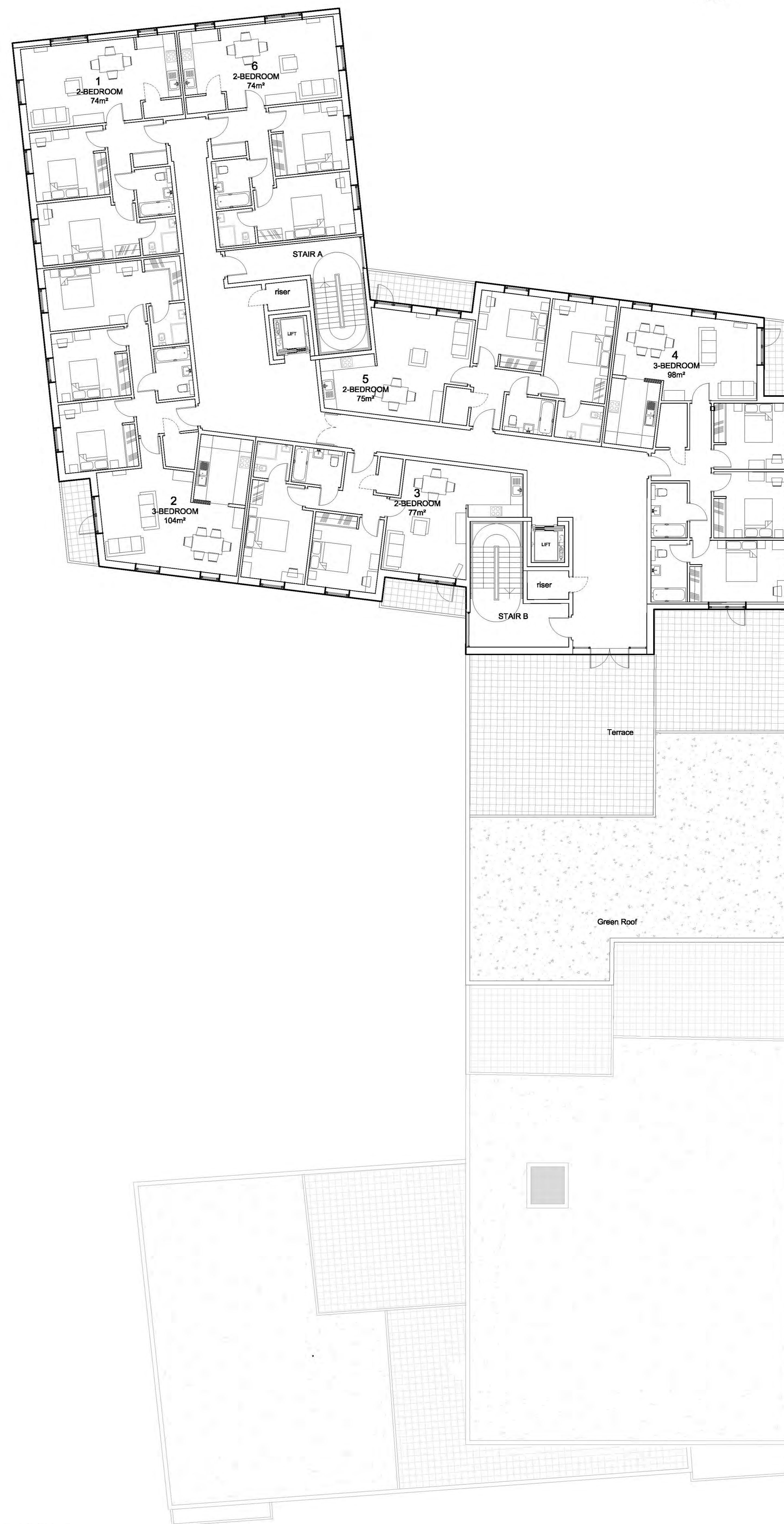
Sixth Floor Plan